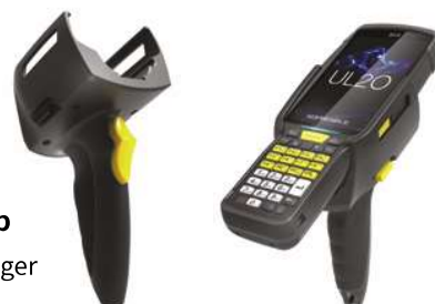
Pistol grip Scanning trigger