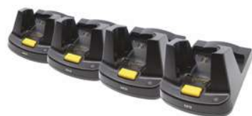
8 slot charging cradle Charging-only 8 slot cradle