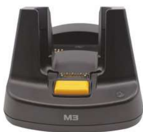
2 slot charging cradle Charging-only 2 slot cradle