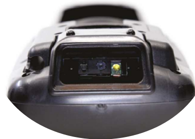
UL20F Scanning window

UL20 has automatic sensor to control temperature of screen and scanning window. When the temperature goes down, the sensor is working to keep moderate line which UL20 operates. The module smartly control LCD. Heating LCD stands alone even UL20 is on sleep status. Also, equipped battery endures low temperature.