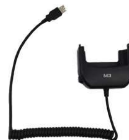
Snap on USB Snap on type

※ The content is possible to addition or change